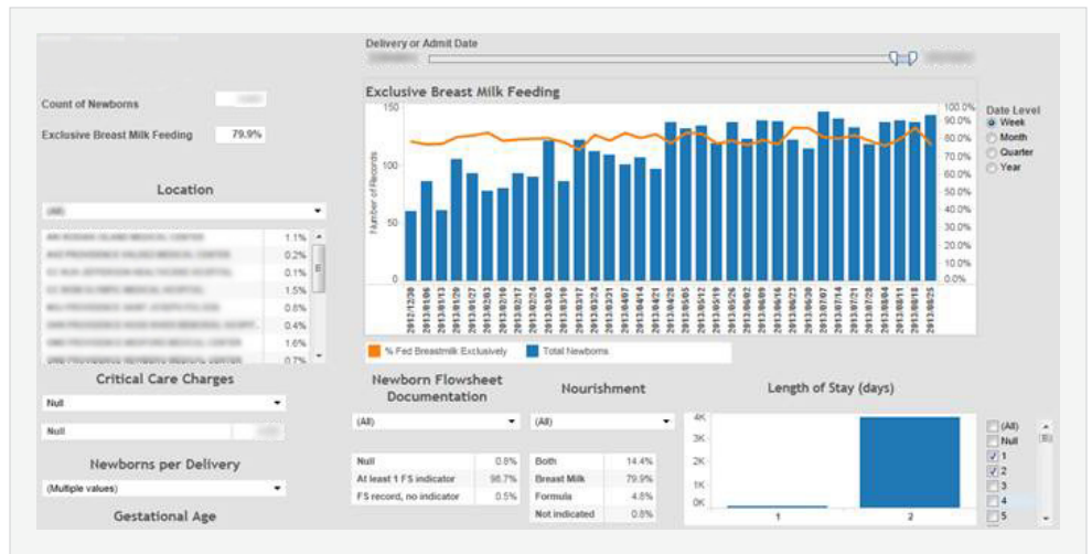
Figure 1: LOS less than or equal to 2 days